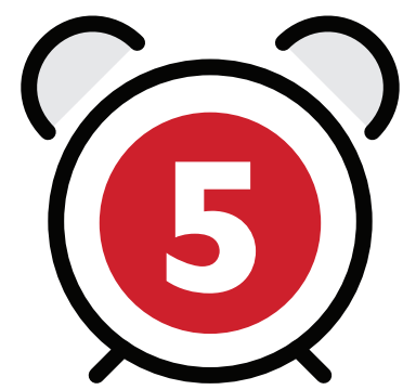
5 DAY DEADLINE