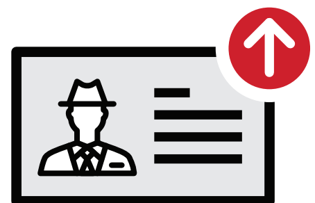
UPLOAD GUARANTOR PHOTO ID