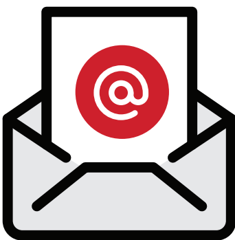
EMAIL ONLINE LEASE APPLICATION