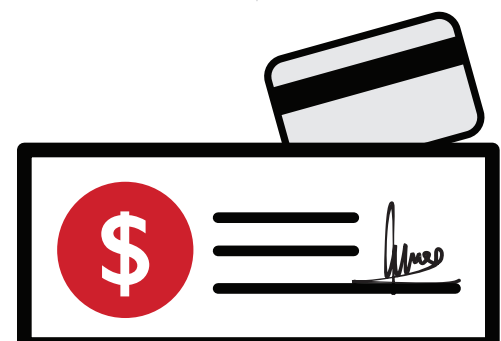
SUBMIT FORM OF PAYMENT