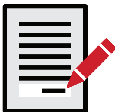
GUARANTOR FORM SIGN